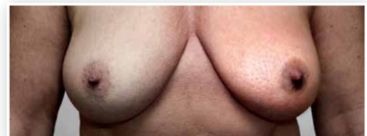
Skin like orange peel? Get it checked!

Breast Cancer Patient Registers that around half of all breast cancers appear between mammograms," says NZBCF breast health nurse Janice Wood. "Most women know to get a lump checked out. But knowledge of other possible symptoms is much lower"